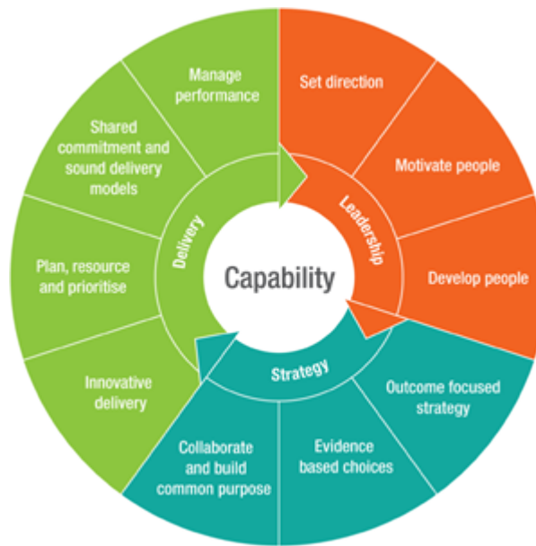
Figure 1: The Capability Wheel

The capabilities of leadership, strategy and delivery are colour-coded within a single Capability Wheel to indicate their integration. They are also sub-divided into three or four sub-components – giving a total of ten sub-elements to organisational capability. In the review process, ratings are assigned to each of the ten elements of the model as part of the final report (according to whether the element of capability is assessed as strong or weak or in need of developmental action).