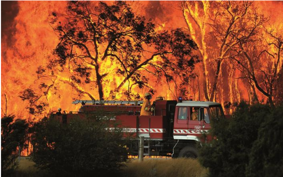
CFA crew.