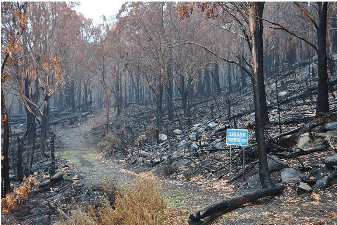
Lake Mountain, Source: Wikimedia Commons, Photographer: Nick Carson.