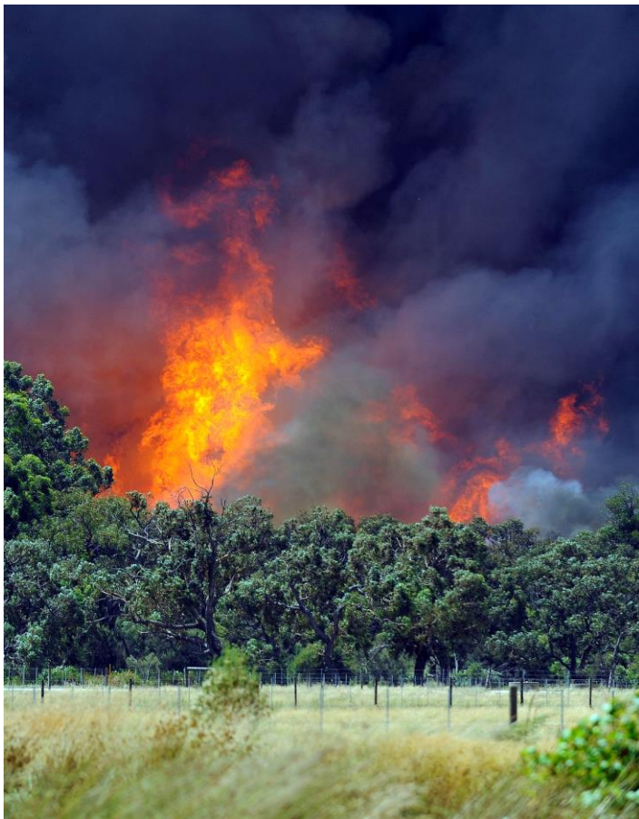
Approaching flames