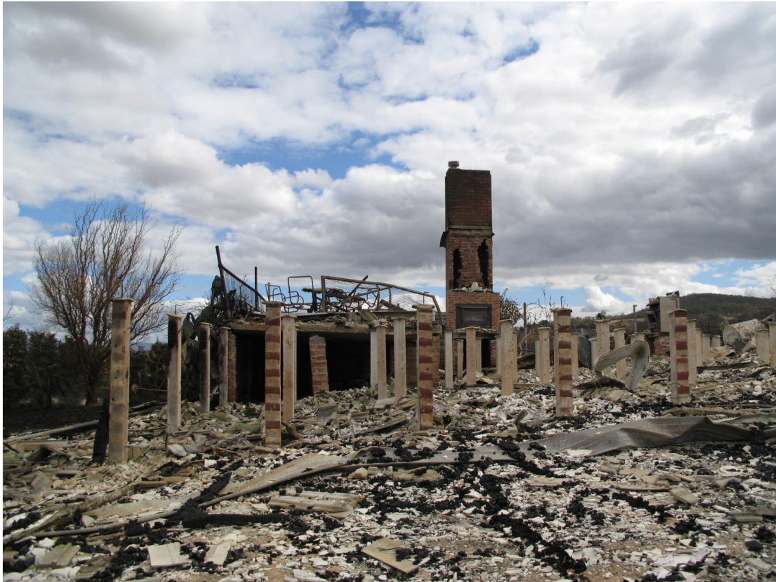
Yarra Glen home after fires