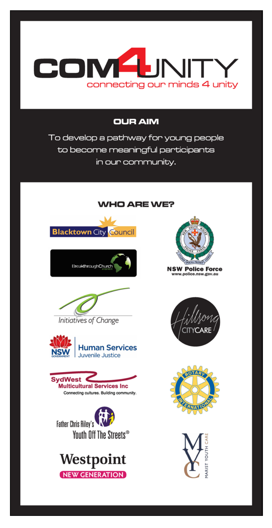
Exhibit 1: The COM4unity partners*

* As at COM4unity official launch in 2010